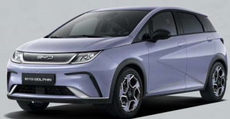
Amethyst Purple (interior: beige & grey)