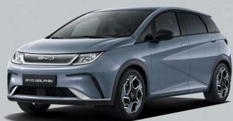
Urban Grey (interior: black & grey)