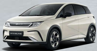
Cream White (interior: beige & grey)