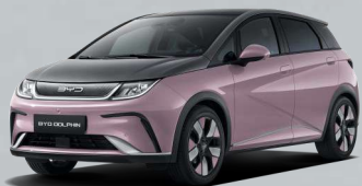
Coral Pink & Urban Grey (interior: white & pink)