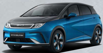
Surfing Blue & Urban Grey (interior: blue & grey)