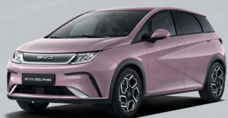
Coral Pink (interior: white & pink)